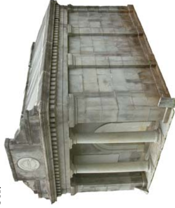
Brantley-Pringle Mausoleum Built 1878

With some exceptions, the erection of large monuments ceased in the cemetery by the 1930s.